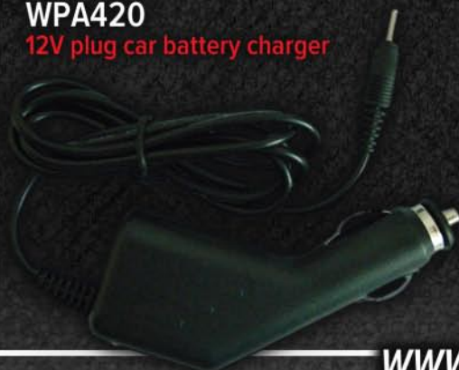
WPA420 12V plug car battery charger