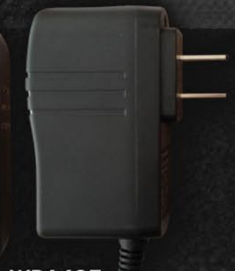
WPA425 110V battery charger