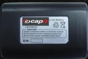
WPA415 Rechargeable lithium-ion battery (spare)